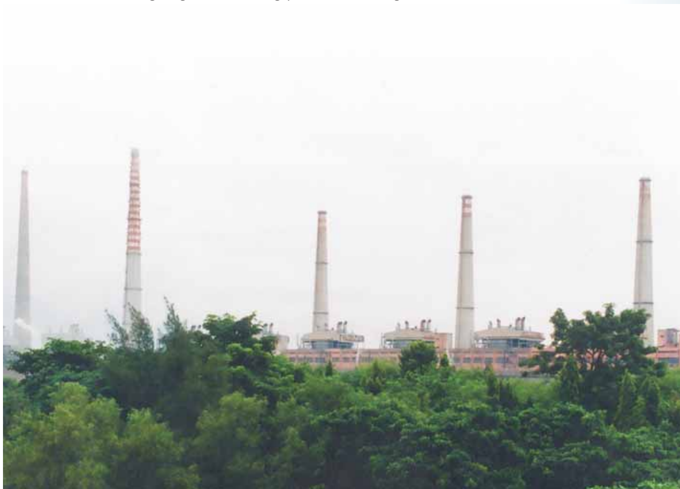
Environment friendly Captive Power Plant of NALCO

10.81 The tender documents have been approved by the Company Court on 3.7.2009 with directions to make some amendments. The matter was placed before the IMG whether to amend the tender documents or to file appeal/review. As per the decision taken in the Inter-Ministerial Group (IMG) and advice of the Deptt. Legal Affairs (DLA), review petition was filed by BGML on 20.8.2009 in the Hon'ble Court for consideration of certain amendments to bid documents. The review petition came up for hearing on 11.9.2009. Hon'ble judge refused to re-consider the orders passed by her. As the revision petition has been turned down, BGML, has filed appeal before the Double Bench of the High Court on 20.10.2009.