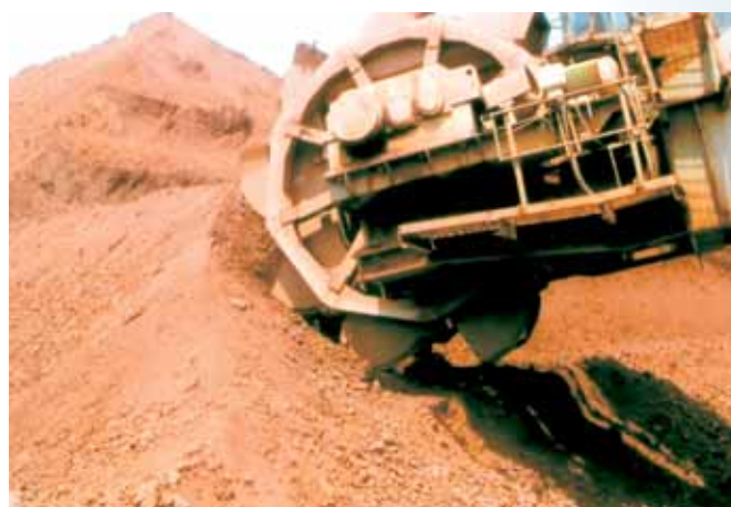
Bauxite Reclaiming at Alumina Refinery

10.5 Bauxite is the primary raw material used to produce alumina and aluminium. The bauxite mine is situated at Panchpatmali hills in Damanjodi, Koraput, in the State of Orissa. This plateau bauxite deposit is mined by a fully mechanized system at a capacity of 4.8 million tonnes per year being upgraded to 6.3 million tonnes per year under 2 nd phase expansion. The capacity of mines is being further upgraded to 6.8 million tonnes per year under the upgradation project. Approximately 90% of the bauxite from the mine represents gibbsitic alumina, also called tri-hydrate alumina, a property which allows it to be digested at a relatively low temperature and at atmospheric pressure during the alumina refining process.