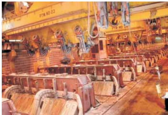
Potroom activities at NALCO Smelter, Angul (Orissa)

10.11 The aluminum smelter entered into production progressively from 1987. Presently, the aluminum