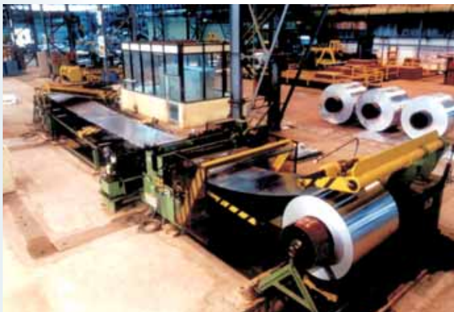
NALCO's Rolled Product Unit at Angul (Orissa)